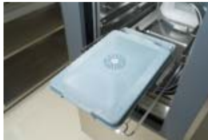
Containers protect implants from environmental contaminants during transport.

Even if O.R. staff knows that the item will not be implanted before the results of the biological indicator are available, this doesn't meet the requirements for the monitoring process. All flash-sterilized items should be treated as an early release and documented appropriately at the time the implant is sent to the O.R. (For an example of early release documentation forms, please see the ANSI/AAMI ST46:2002, Annex C, pages 73 and 74.)