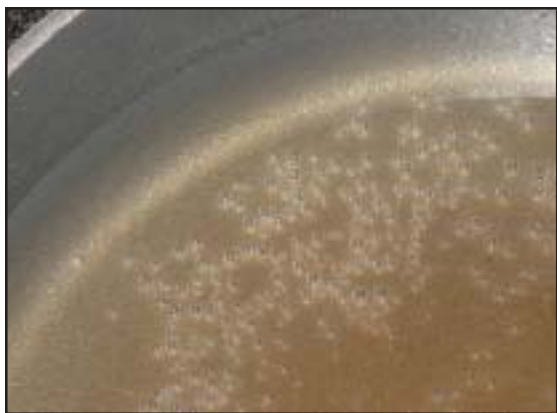
Figure 2: Boiling water on a stove top. A long time before the water boils, bubbles form in the water near the heated surfaces. You can tell these bubbles are air, not steam, because they stay on the surface of the water as a bubble.

dioxide (CO 2 ). These two gases can cause problems with corrosion. Boiler treatment specialists will add treatment chemicals to the system to try and head off these negative impacts.