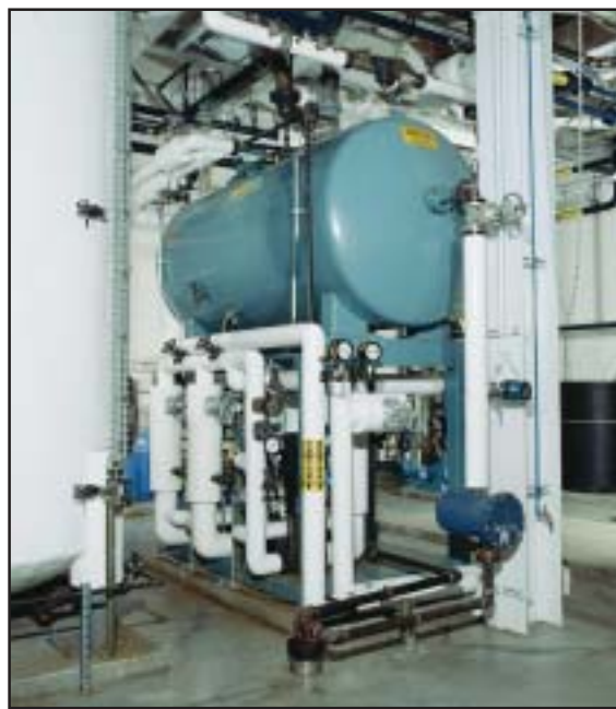
Figure 3: Deaerator (DA) tank in boiler room