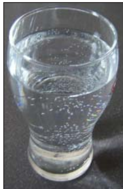
Figure 1: Leave a glass of water out overnight and see gas bubbles accumulate by morning

Boiler feedwater. Air and other gases are dissolved in water. You can see them by leaving a glass of water on the nightstand overnight. In the morning there will be